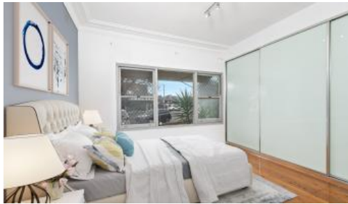
Unit 1, 153-157 Bestic St, Kyeemagh