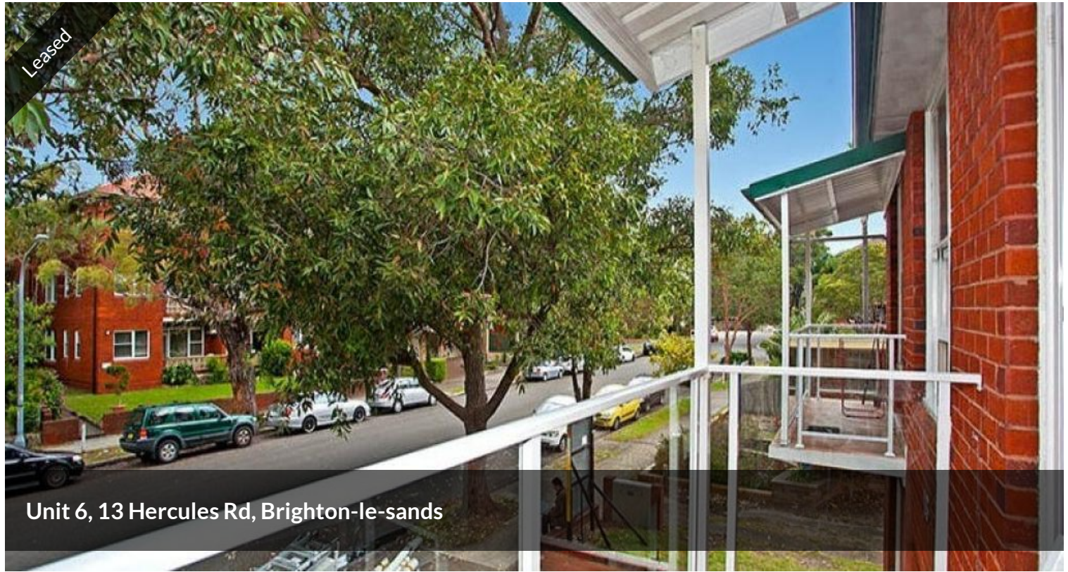
Unit 6, 13 Hercules Rd, Brighton-le-sands