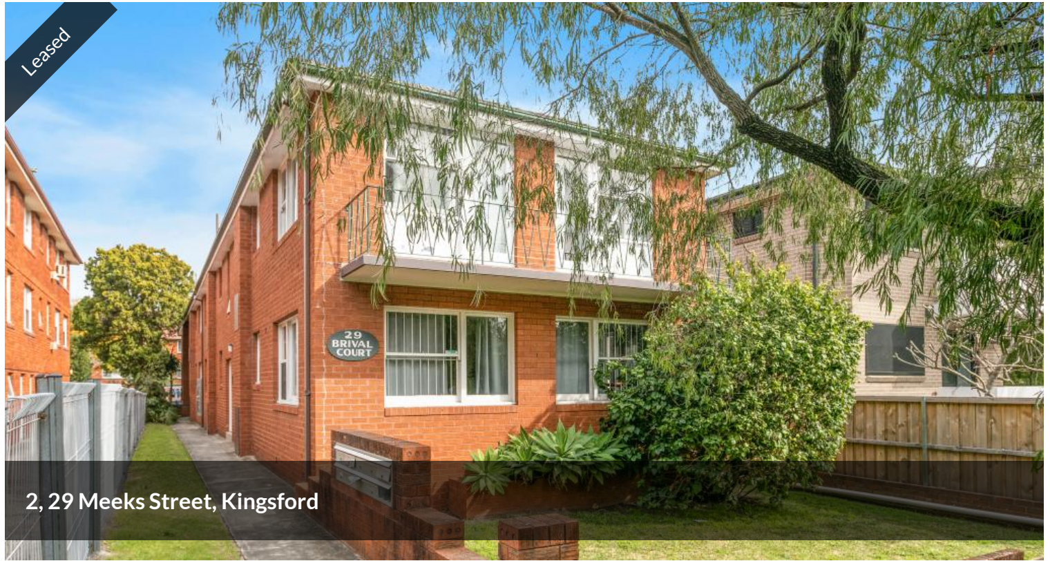
2, 29 Meeks Street, Kingsford