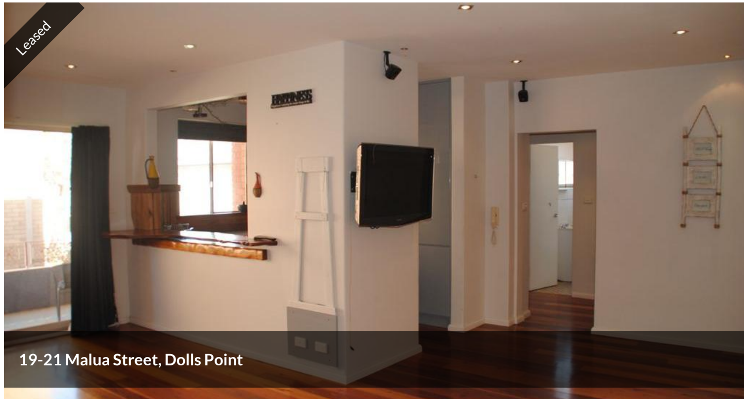
19-21 Malua Street, Dolls Point