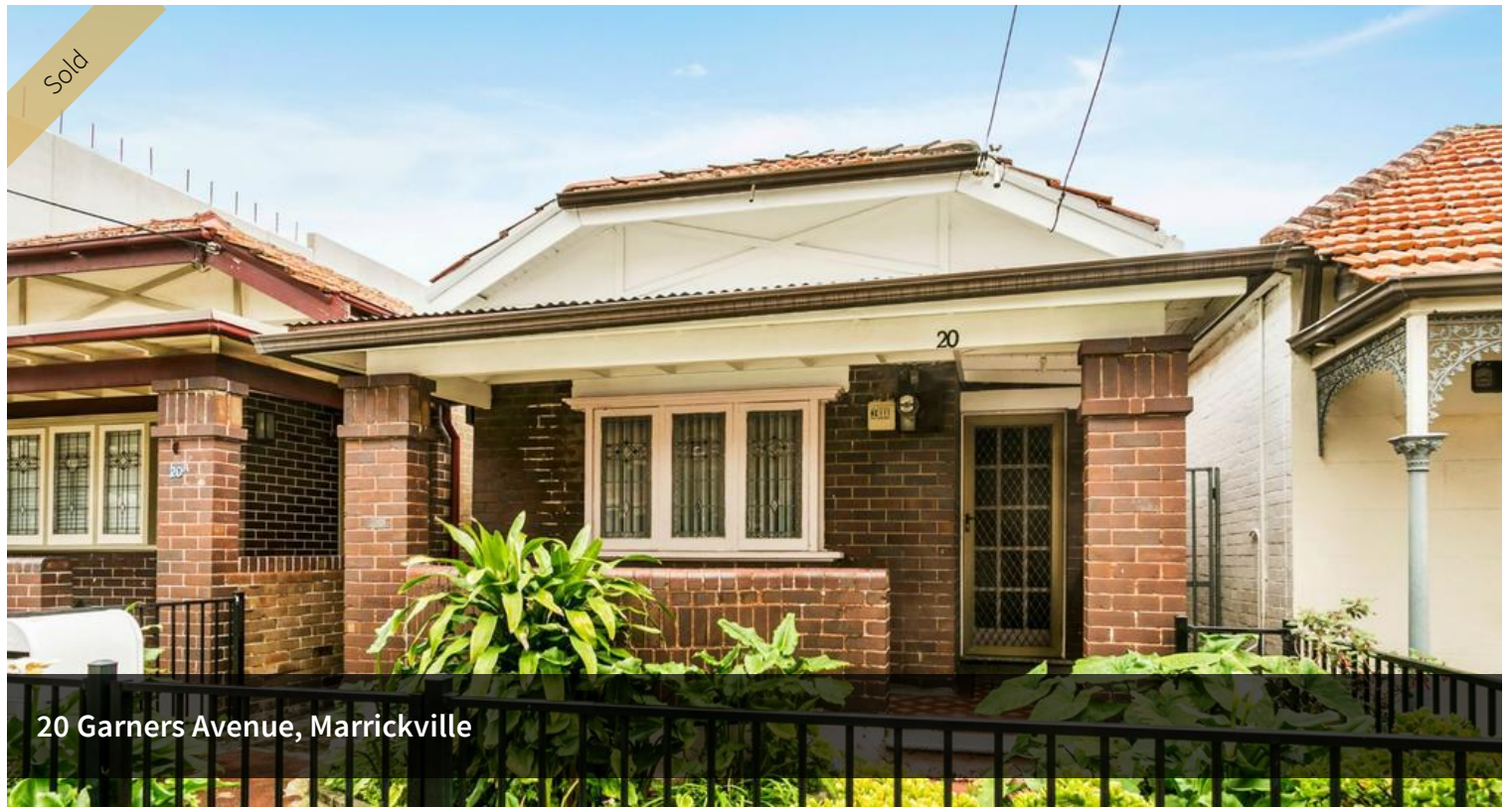
20 Garners Avenue, Marrickville